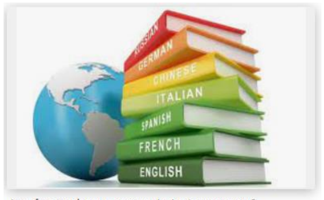
Is a foreign language worth the investment?