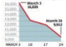
Dow declines at record pace

"I don't mind trade wars when we're losing $58 billion a year," the president said last year. But Chinese officials have made it no secret that they will not let tariffs go unanswered. The Asian giant is the largest holder of US debt, owing some