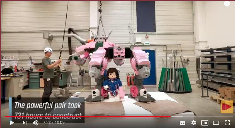
Timelapse: 10 Epic LEGO Models Built Before Your Eyes!