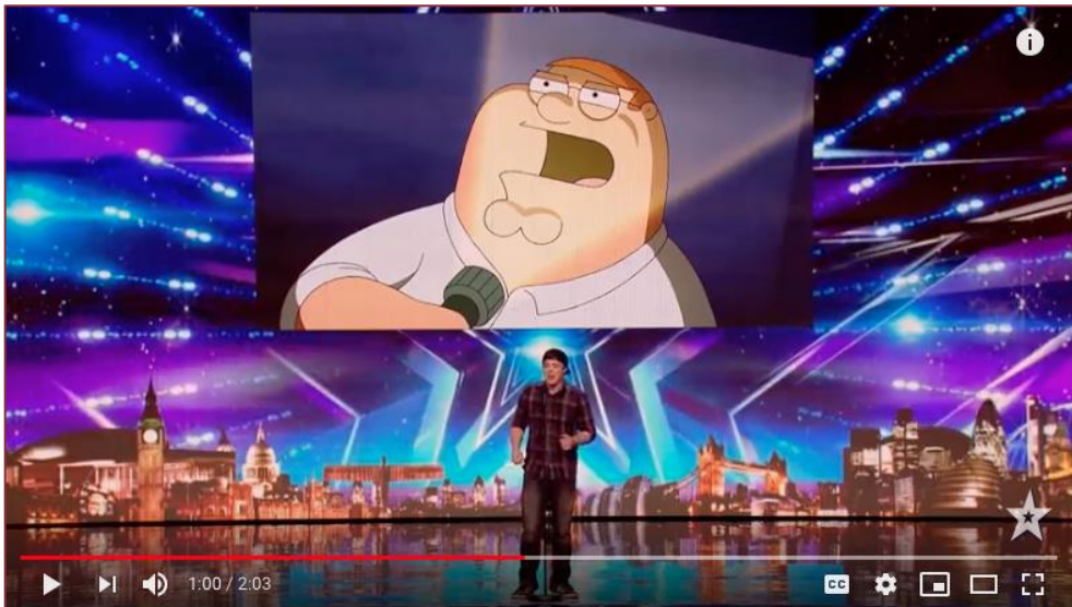
#gottalent #talent Peter Griffin, Elmo & More Sing Wrecking Ball On Britain's Got Talent