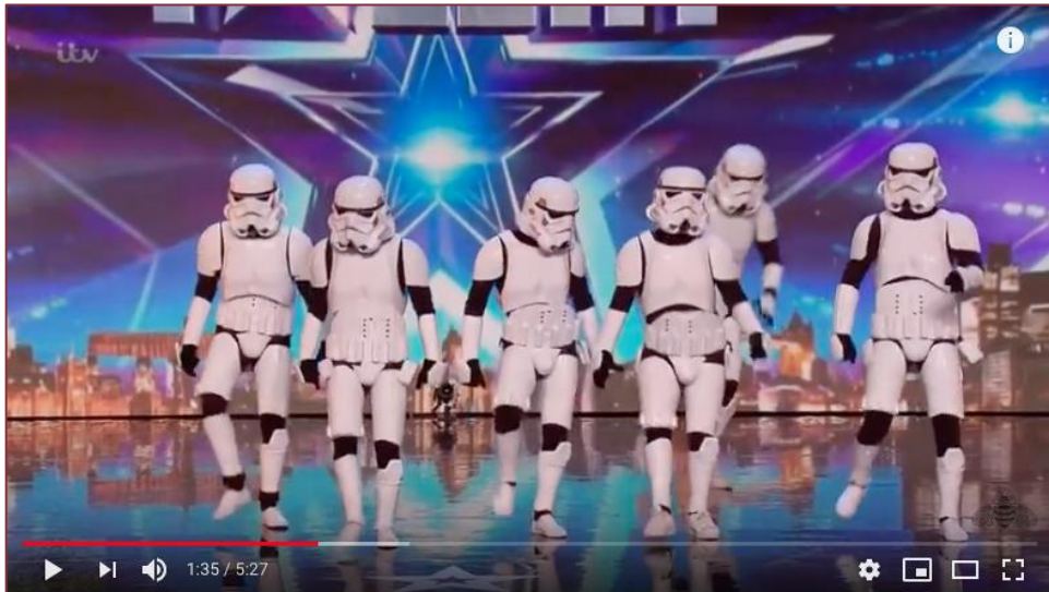
#TonyPatrony Britain's Got Talent 2016 S10E05 Boogie Storm Star Wars Inspired Cosplay Dance Crew Full